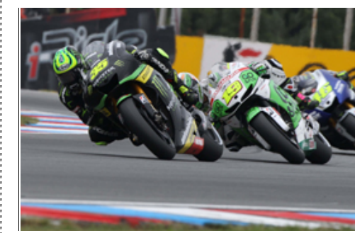
MotoGP news: Cal Crutchlow wants Tech 3 to shelve Yamaha upgrades