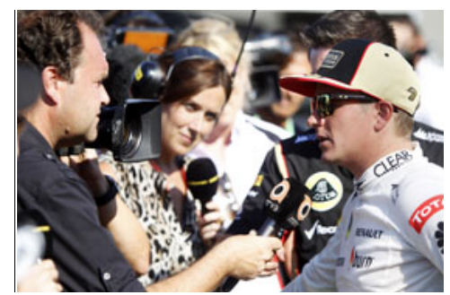
F1 news: Kimi Raikkonen has no idea where he stands in Red Bull F1 talks