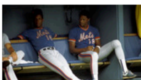
The 1984 Mets Reincarnated in D.C.