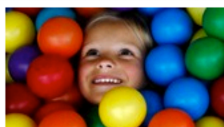
Tots Invade Luxury Hotels