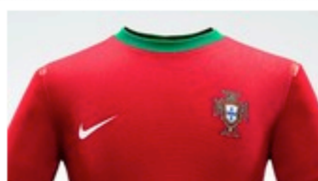
New Rating Tool for Green Outfits