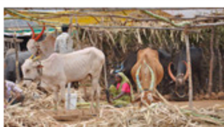
In India's Farming Heartland, Barely a Raindrop Falls