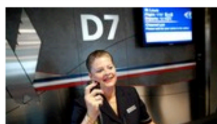
Elite Treatment From a Gate Agent